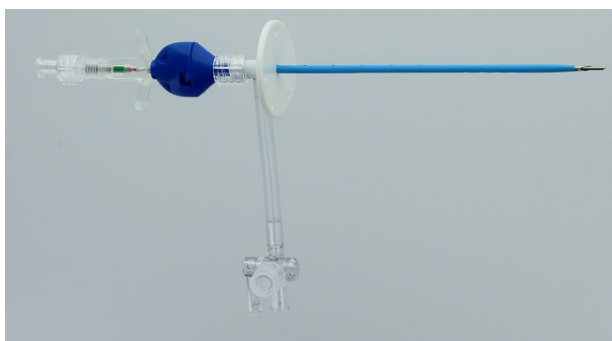
Figure 1: R51551-08-00 Rocket Thoracentesis Catheter 8Fg