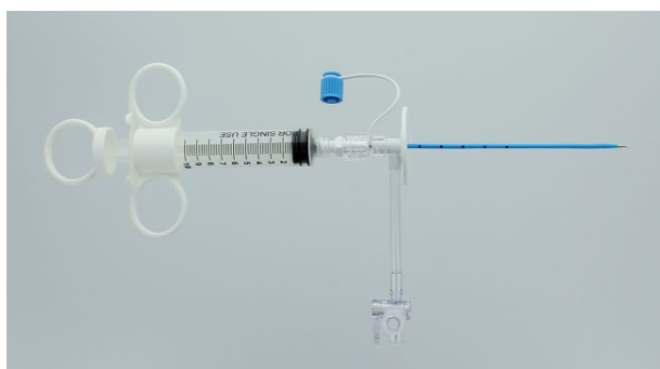
Figure 2: R51551 Rocket Thoracentesis Catheter - 6Fg